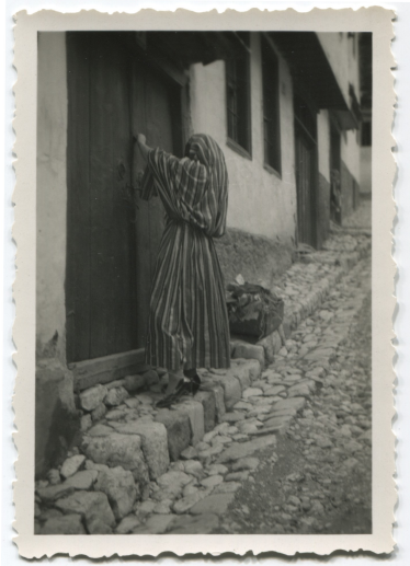
Woman in the street