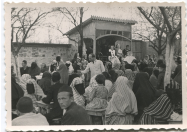
Outdoor event