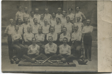
Participants of the Sokol Serbian teachers' course