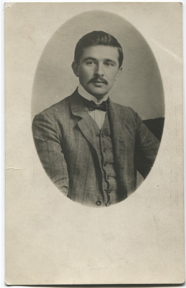
Portrait of Veljko Čubrilović