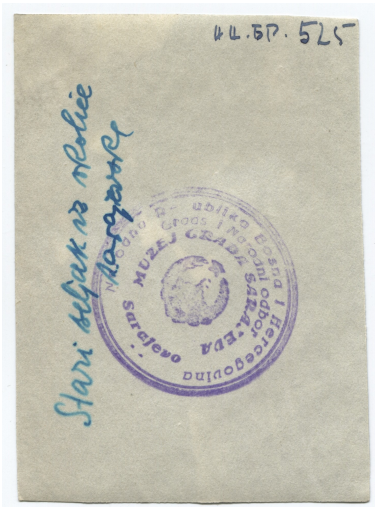
Portrait of an old peasant man