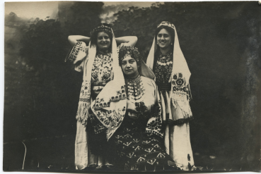
Folk costumes from Western Bosnia