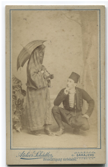
Souvenir card depicting a Muslim woman and man