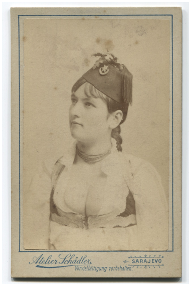
Studio portrait of a young Muslim woman