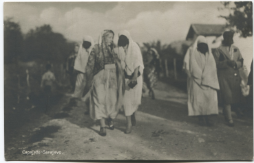
Veiled women walking in the street