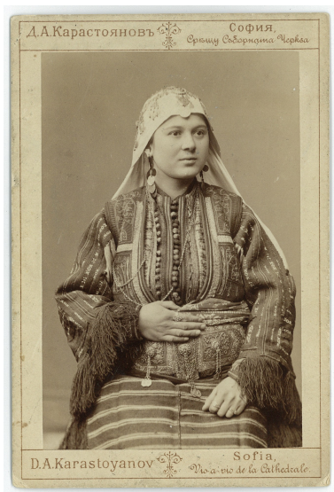
Studio portrait of a woman in folk attire