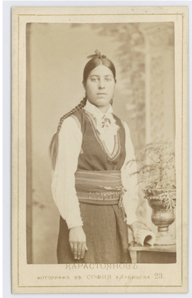
Studio portrait of a woman in folk attire