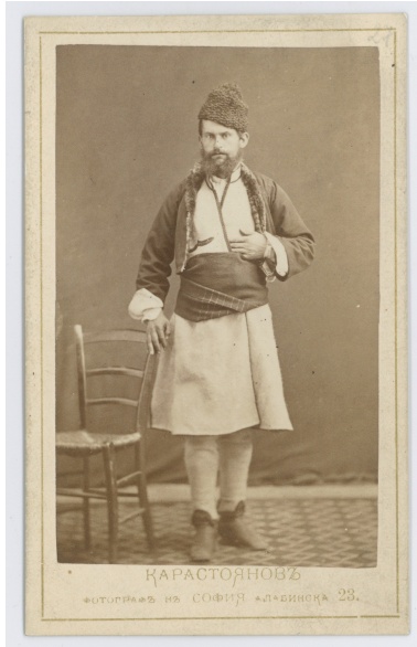
Studio portrait of a man in folk attire