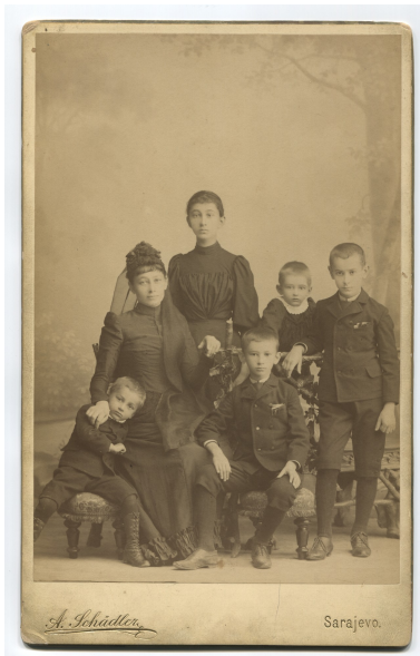
Family portrait