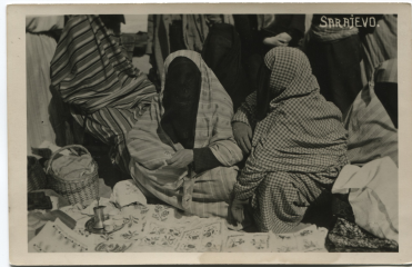
Market scene with two Muslim saleswomen