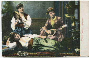
"Turkish Folk Costumes"