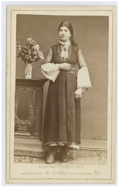
Studio portrait of a woman in folk attire