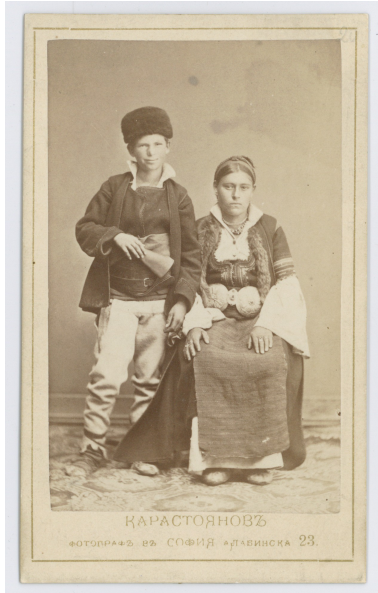
Studio portrait of a young woman and a boy in folk attire