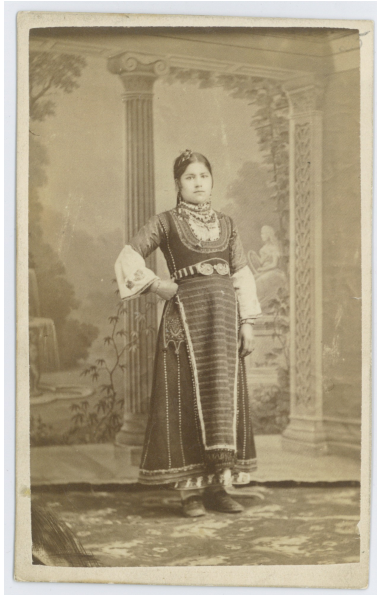
Studio portrait of a woman in folk attire