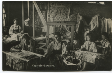
Interior of the manufactory for weaving, embroidery and stitching lace