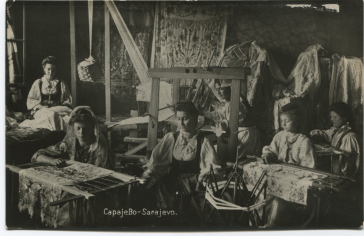
Interior of the manufactory for weaving, embroidery and stitching lace