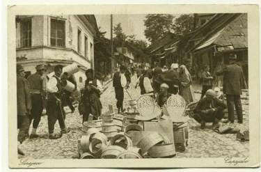
"Nadkovači Street"