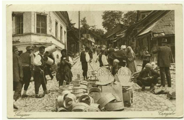
"Nadkovači Street"