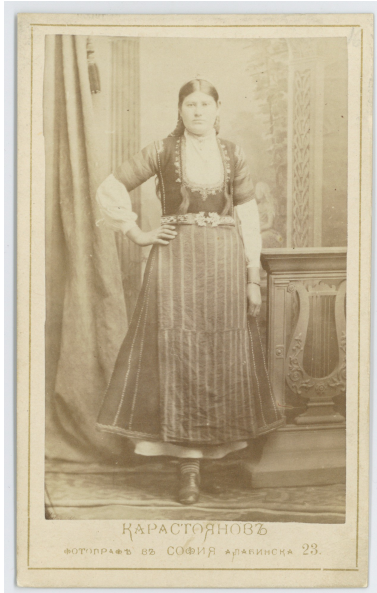
Studio portrait of a woman in folk attire