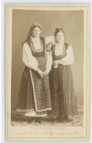
Studio portrait of two women in folk attire