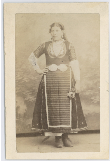
Studio portrait of a woman in folk attire