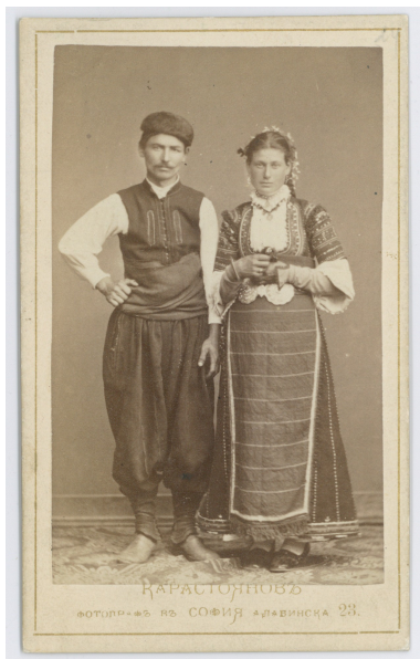
Studio portrait of a women and a man in folk attire