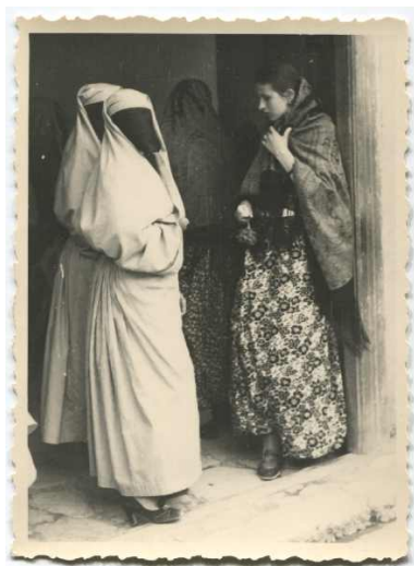
Muslim women