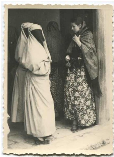
Muslim women