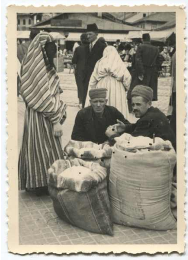
Street vendors