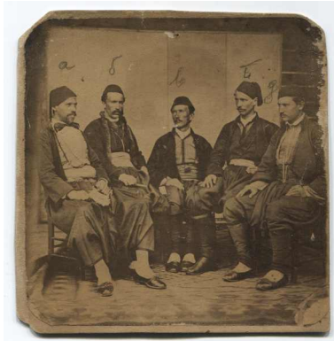
Portrait of five Sarajevan merchants