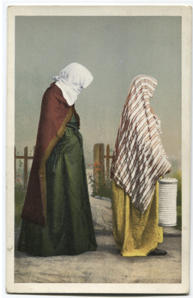
"Turkish Women On The Street" © Museum of City of Sarajevo