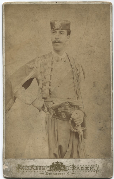
Studio portrait of a man wearing a Bey's costume