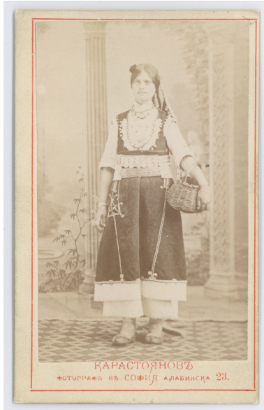
Studio portrait of a woman in folk attire