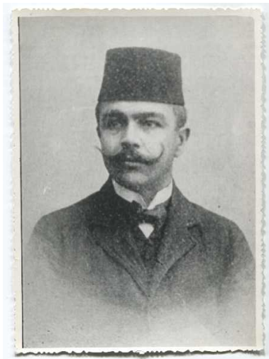
Portrait of Safvet beg Bašagić