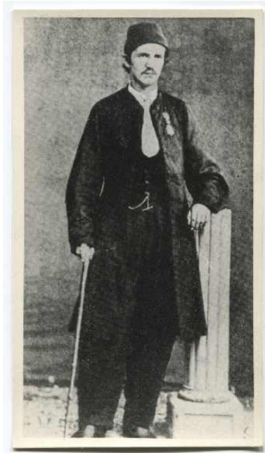
Portrait of Mehmed Šaćir Kurtćehajić