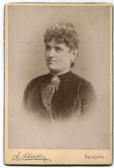
Portrait of Kristina Kraljević