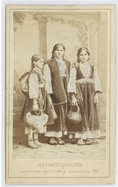
Studio portrait of three girls in folk attire