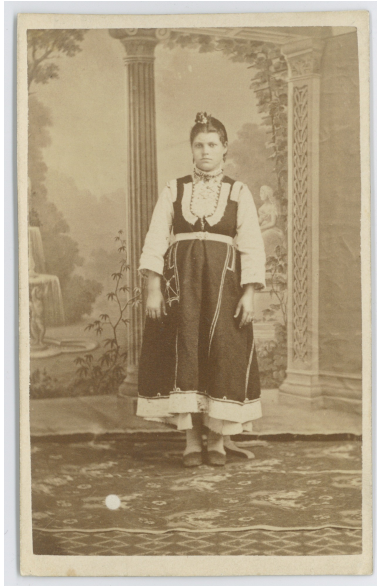
Studio portrait of a young woman in folk attire