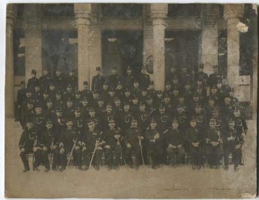
Group portrait of the Sarajevo police garrison