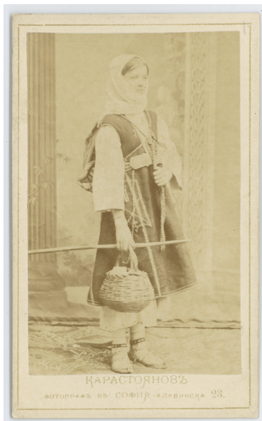
Studio portrait of a woman in folk attire