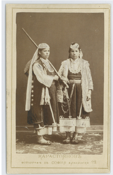
Studio portrait of two women in folk attire