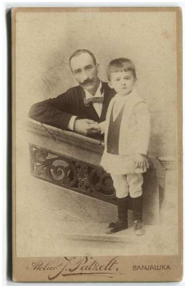
Studio portrait of a father with his son