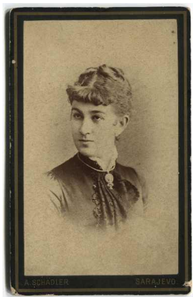
Studio portrait of a woman