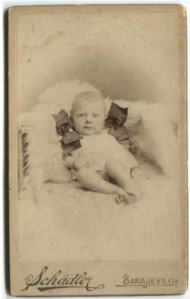
Studio portrait of a baby

Object: Studio portrait of a baby Description: Full-length shot of a baby from the Sladović family posed on a coat. The child is wearing a light-coloured dress with a quilling on both shoulders. Date: Not after 1897 Location: Sarajevo Country: Bosnia and Herzegovina Type: Photograph Creator: Schädler, Anton, (Photographer) Dimensions: Artefact: 104mm x 64mm Image: 90mm x 58mm Format: Carte de visite Technique: Not specified