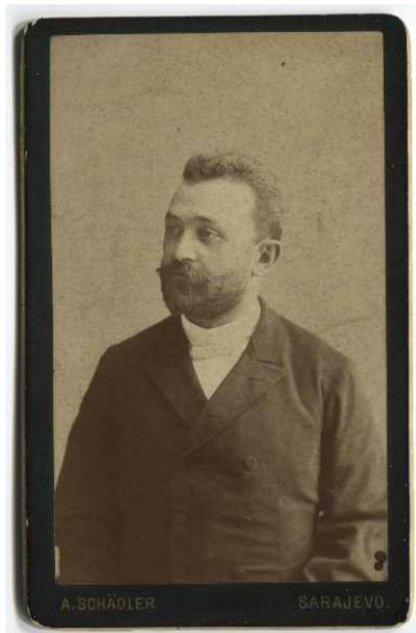
Studio portrait of a man