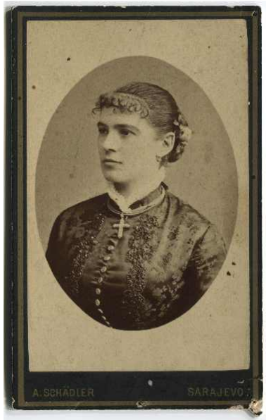
Studio portrait of a woman