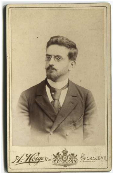
Studio portrait of Kosta Ćuković