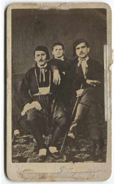
Studio portrait of two men and a boy