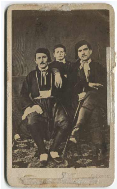
Studio portrait of two men and a boy