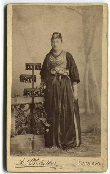
Studio portrait of a woman