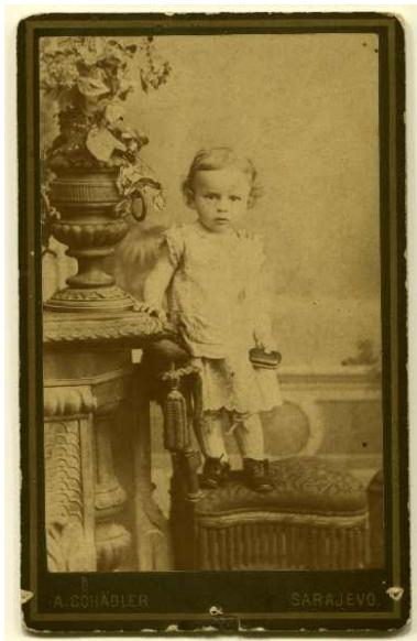
Studio portrait of a child