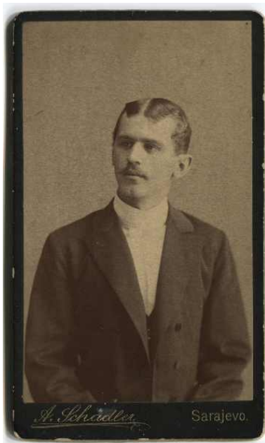
Studio portrait of a man