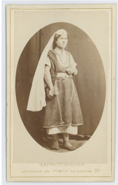
Studio portrait of a woman in folk attire