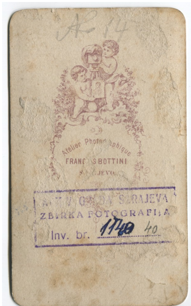
Studio portrait of a man